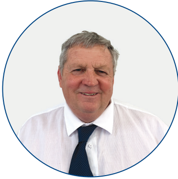
Craig Jepson Kaipara Mayor