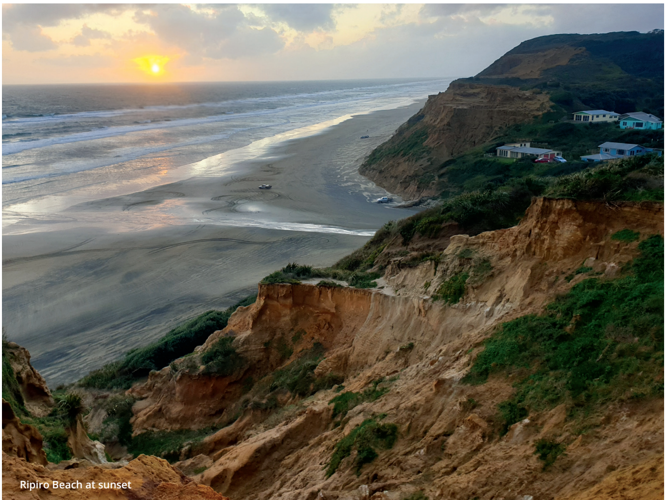
Ripiro Beach at sunset

Please note: Numbers are rounded, a full breakdown can be found in Part Two of the full 2022/2023 Annual Report.